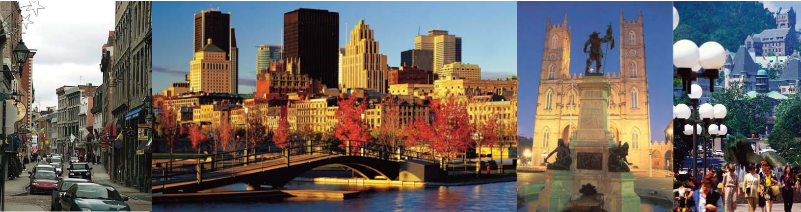
EXHIBIT & SPONSORSHIP PROSPECTUS